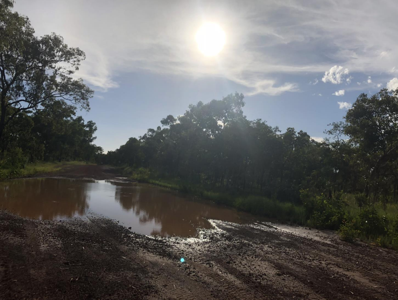
Road in wet season.