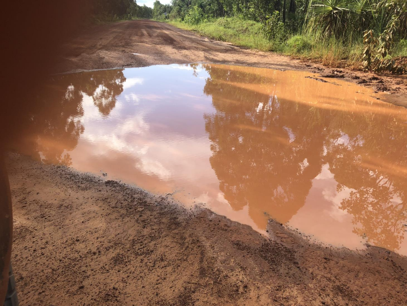
Road in wet season.